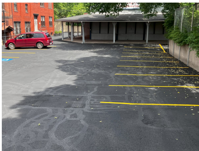
Parking lot after repairs were completed