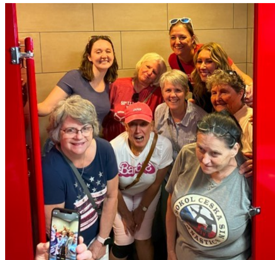
Bike Hike –Women Only!