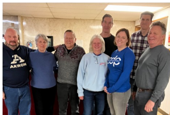
2025 Officers looking especially happy