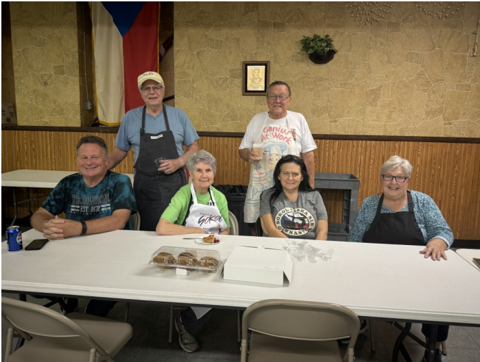
Hall Dinner Dumpling Gang