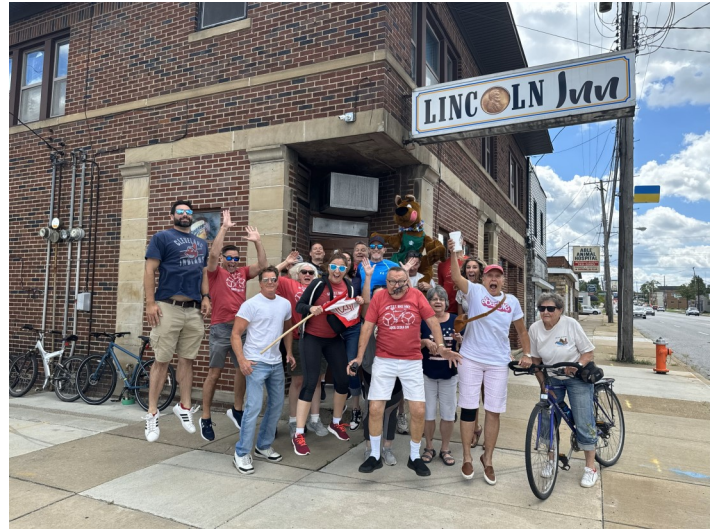
Bike Hike Starting Point