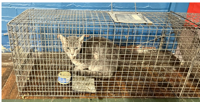
PITA the cat