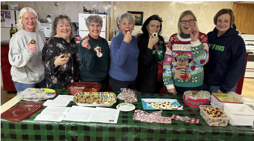
Actual cookie bakers

And best of all, everyone went home with a sampler of all the different cookies! A tradition worth continuing!