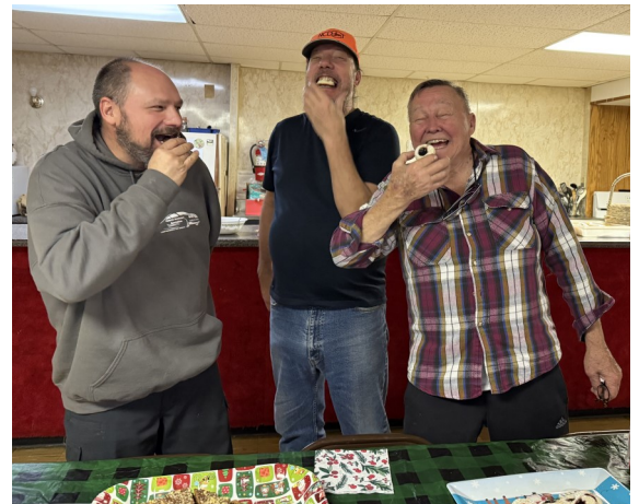
Interlopers somehow managed to sneak in